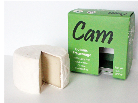
Botanic Camembert NET WT. 6.8 oz (190g) Fridge or Freezer