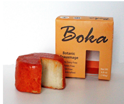
Botanic Boka NET WT. 6.8 oz (190g) Fridge or Freezer