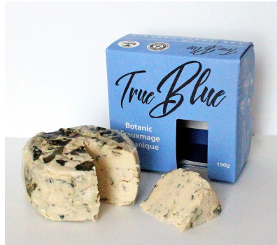
Botanic True Blue NET WT. 6.8 oz (190g) Fridge or Freezer