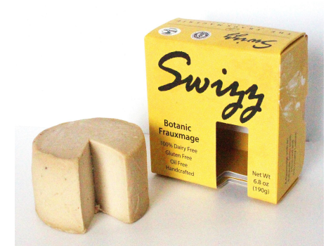
Botanic Swizz NET WT. 6.8 oz (190g) Fridge or Freezer