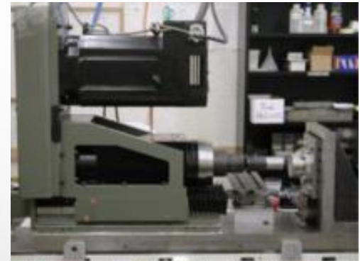
Advanced Manufacturing Processes Lab