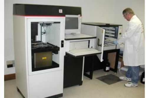
Rapid Prototyping and Product Development Lab